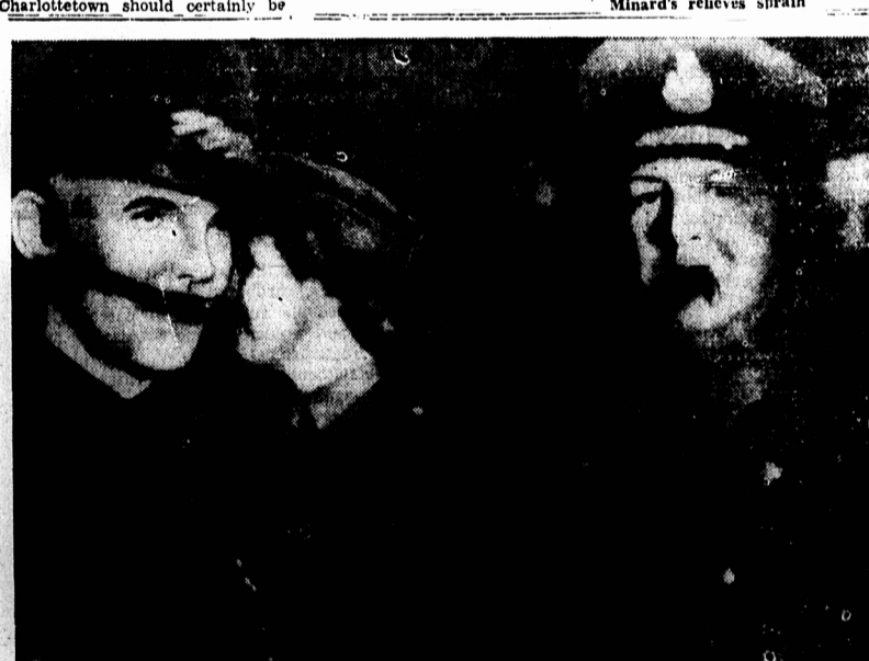
It's fine to have you with us, sir, said the policeman as he was taken by the light of fires started by bombs as Britain's leader, with his uniformed daughter Mary (center), toured London in the blackout. This remarkable only a half-hour after a German raid.