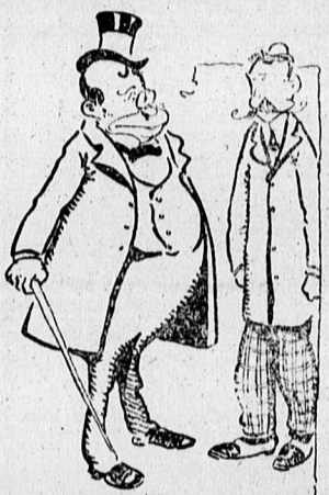
The burglar helped himself to a half-dozen of the jeweler's best watches. "Thank Heaven," he muttered to himself, "time is money."