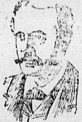
EX-PREMIER BALFOUR WHO OPOSED THE RECENT BUDGET.