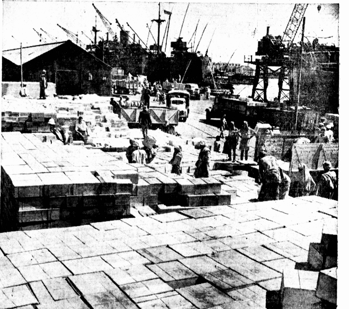
Large quantities of war materials and supplies continue to arrive by convoy in the Middle East and at Malta from Britain and the United States. Photo shows tons of corned beef being loaded on to trucks at the quayside. Much of this beef comes from Canada and is shipped in armed convoys from Great Britain.