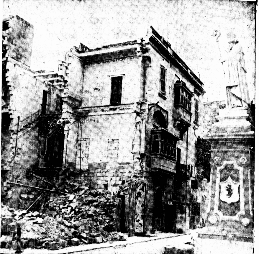
Bomb raids have forced many Maltese to leave the island, others to live in underground shelters. A sculptured bishop (above), still intact, gazes from his plinth at the wreckage of a building on a bombed Valetta street corner.