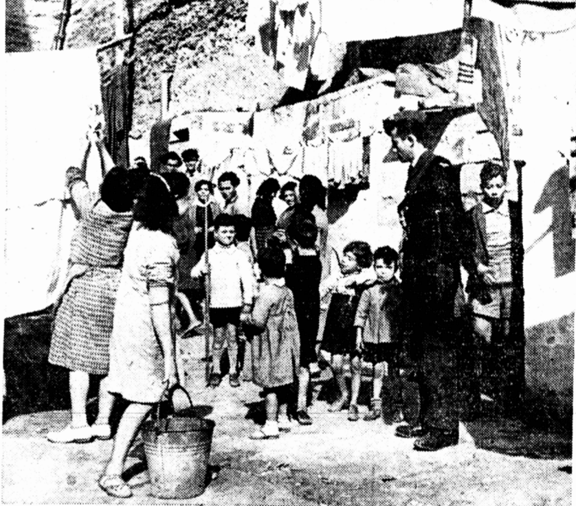
Miniature cycles save gasoline (left) at defence posts. R.C.A.F. airman watches children at play, women hanging up clothes amid the wreckage of bombed streets. The motto (right), painted on the side of a plane, means aircraft goes everywhere. Notable among R.C.A.F. heroes are many from the Prairies and West Coast.