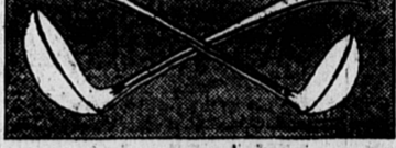
Correct ladles... for gravy and cream, respectively, $3.25 and $2.50

INTERNATIONAL SILVER CO. OF CANADA, LTD., HAMILTON, ONT.