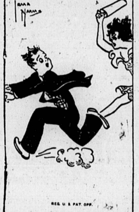
"The call of the wild reminds a man that his best friend is his dogs."