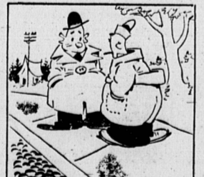
"Money talks." "Yes, but 'farewell' is the only thing it ever says to me."