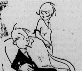
"I've got to have something to get the cobwebs out of me brain, you know." "Tried a vacuum cleaner?"