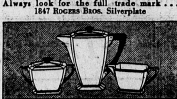
3-piece tea set. Shown in Legacy pattern, $87.75

Always look for the full trade mark... 1847 ROGERS BROS. Silverplate