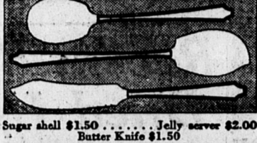
Sugar shell $1.50... Jelly server $2.00 Butter Knife $1.50