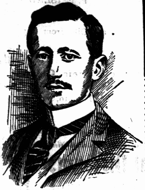
SIGNOR MARCONI, INVENTOR OF WIRELESS TELEGRAPHY.

IT CURES AND PERMANENTLY BANISHES Rheumatism, Sciatica and Neuralgia. It Straightens and Limbers Twisted and Stiff Joints and Muscles.