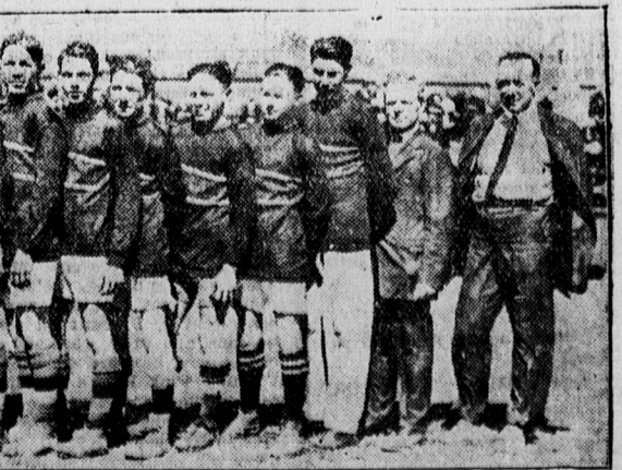
Soccer is making tremendous strides among the Toronto school boys, and recently Central Technical School Team, winners of the High School League Championship, were presented with the Wainwright Cup and Medals. Our picture shows the champions.