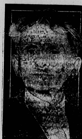
Dr. Albert Michelson, California savant, has built a vacuum tube a mile long to help him check up on his measurements of the velocity of light.