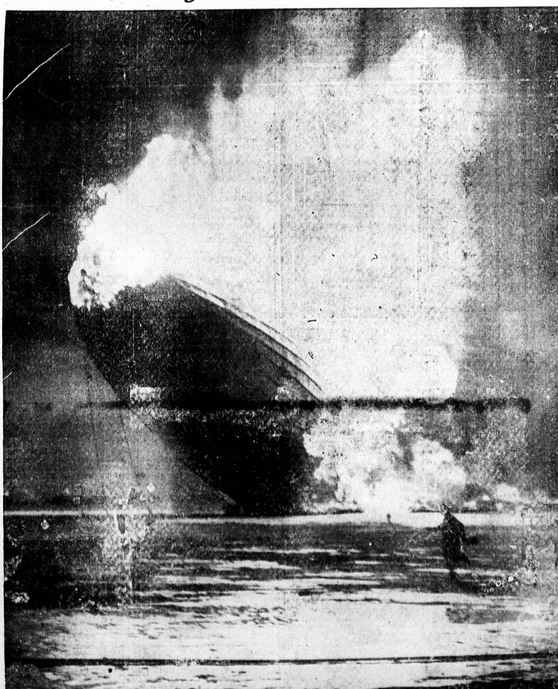
For a few futile moments after the explosion the unharmed portion of the Hindenburg kept the wreckage in mid-air—then it plummeted to earth, to lie grimly silhouetted by the flames on the field of the naval air base at Lakehurst, N. J., a death trap for scores of passengers and crew in one of the most tragic air disasters in America.