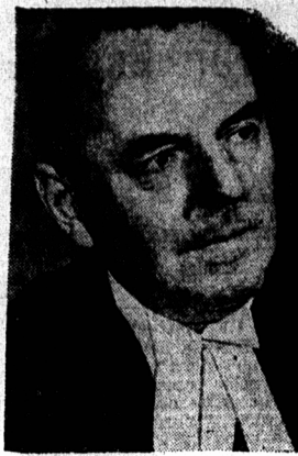
SIR BRIAN DUNFIELD Justice of Nfld. Supreme Court