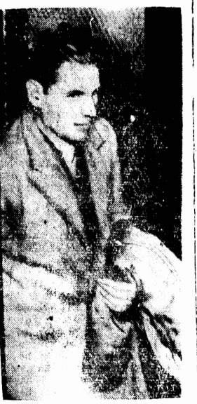
CHARGED WITH WIFE'S MURDER