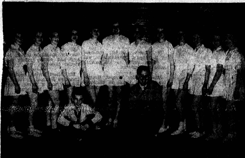
Pictured above is the Prince Edward Island Hospital Nurses basketball team who last night captured the Island senior ladies basketball championship by taking their second straight victory from the Prince of Wales College Co-eds, the defending champions.