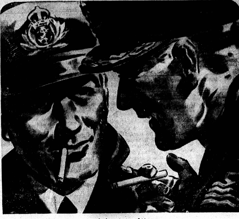
PLAYER'S MILD Plain - have "Waterproof" paper which does not stick to the lips.

So Satan, the devil, who is the prince of the air, is the story which Xenophon relates of this conqueror, young Cyrus. So Satan, the devil, who is the prince of the air, is the story which Xenophon relates of this conqueror, young Cyrus.