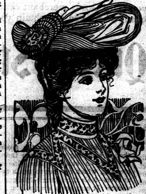
TAILOR MADE HAT.

A great variety of small flowers, rosebuds, fuchsias, small berries, etc.,