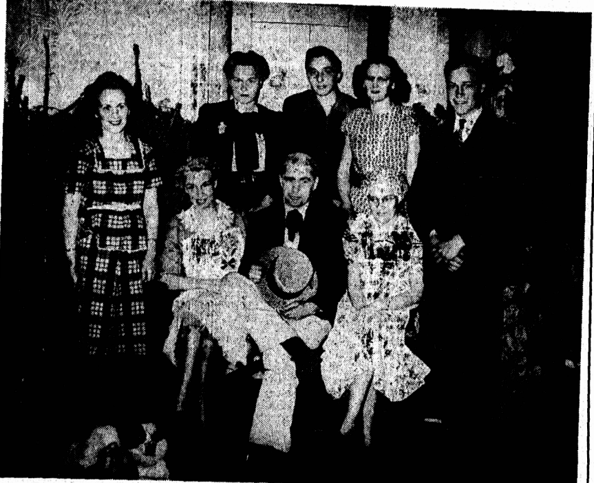
The Cape Traverse players who placed second in the Provincial Drama Festival finals at the Empire Theatre last night.