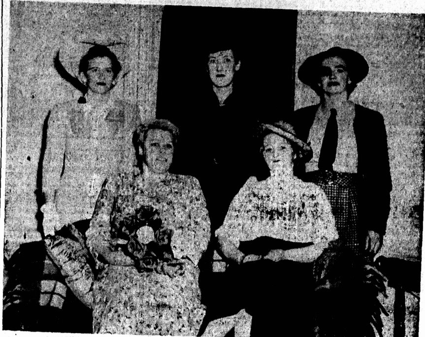
Above is pictured the cast of Provincial Drama Festival finals... York Women's Institute play last night.