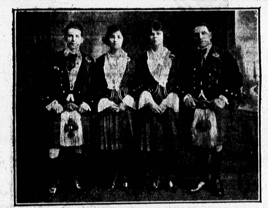
The Scotch Quartet