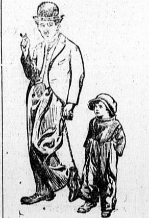
CHARLIE CHAPLIN IN A SCENE FROM "THE KID"