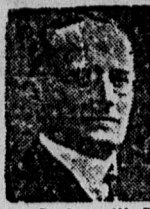
THE TONGUE IS A MIRROR