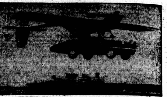
Flying four-seater automobiles seen on first test flight at San Diego, Calif. has detachable wing, separate engine in car for ground operation. The flight lasted 78 minutes and was pronounced successful.