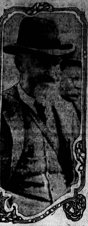
GEORGE BERNARD SHAW the novelist, who made himself unpopular with the people of Manchester by referring, in a speech at Dublin to the Manchester City Art Gallery in most slighting terms. He called it a "picture dealer's lumber room."

The family remedy for Coughs and Colds. Shiloh costs so little and does so much!