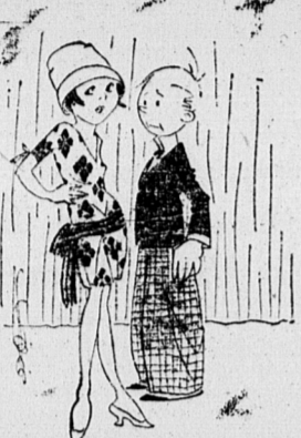
He: How can I square myself for trying to kiss you last night? She: By actually kissing me now.