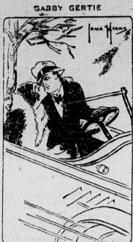
"Many a motor trip is just a bus ride."