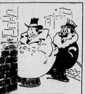
"Is she really as bad as she's painted?" "Gosh! Y' don't call that a bad painting job, do you?"