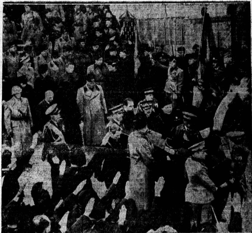
From the highest to the humble villager, all Italians paused in their work when final tribute was accorded Gabriele d'Annunzio a few days ago. Our photo above shows Premier Mussolini following the coffin being taken to the gun carriage upon which it made its journey from the little chapel at Gradone to the warship Puglia. The Princess of Montevosio, widow of the famous poet, heavily veiled and in deep mourning walks beside Mussolini.