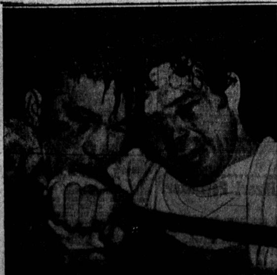
If you judge by this picture Max Haer is as badly beaten up as Tommy Farr. Tommy at the left is trying hard to smile through closed eyes. Max isn't making much of a fist of it either. He was the victor but he looks dog tired and judging from the split eyes and the bashed countenances they were equally tired at the finish.