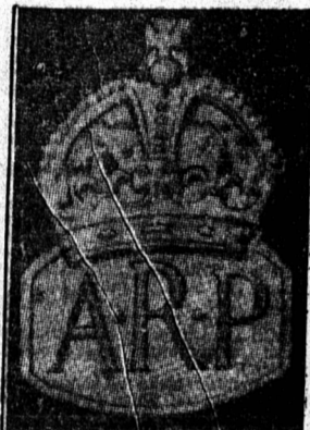
With Britain concentrating on the expansion of her Air Force and the protection of civilians against raids, volunteers accepted for Air Raid Precaution services are being equipped with the special badge shown above, the three letters plainly signifying the particular branch of service. Sir Samuel Hoare yesterday called for 1,000,000 such volunteers.