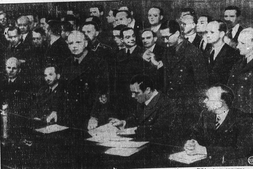
The historic scene at the German Foreign Office as Foreign Minister Joachim von Ribbentrop announced to the world that Germany had begun its invasion of Russia, 15th nation to feel the force of the Nazi war machine and first with whom Germany declared a state of war to exist. Left to right, foreign ground: Foreign Office Minister Weltsaecker; Press Chief Dietrich; von Ribbentrop; Foreign Office Minister Schmidt; and Propaganda Minister Delegation Brauweller.

NEW YORK, June 26 (AP)—The American Hockey League voted today to continue its affiliation agreement with the National Hockey League until 1942, and to permit clubs in the major circuit to draft players until July 1. FASTING "OLD LADY" LONDON (CP)—For the first time in history the Bank of England "old lady of Threadneedle Street" has allowed posters of the "Lend to Defend" series to be pasted on her august walls.