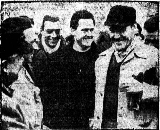
FROUD PAPA — Italian film director Roberto Rossellini (at right), who admitted "I am the father," smilingly accepts congratulations on his return to a movie set outside Rome after the birth of a son to actress Ingrid Bergman. He said the child will be named Roberto Ingmar.