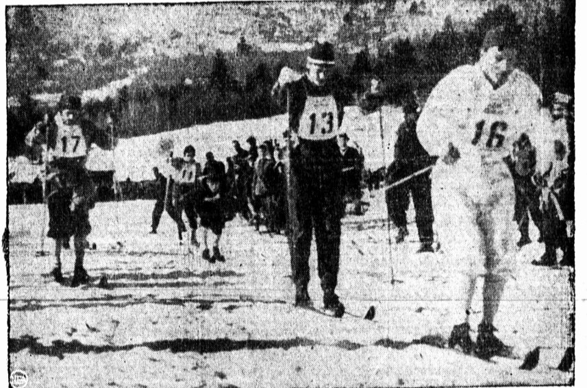
LONG WAY TO GO — Contestants move into position at the start of the International Ski Federation's 40-kilometer ski relay championship at Rumford, Me. Sweden was the unofficial winner at first reports. Meanwhile, Norway was scoring a sweep in the jumping championship at Lake Placid, N.Y.