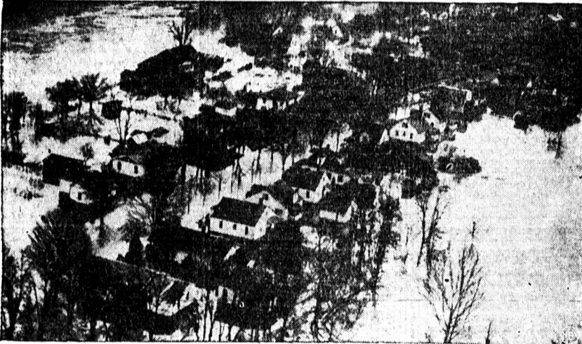
OLD KENTUCKY WATERLOGGED HOME — Water from the flooding Cumberland River swirls around homes in Williamsburg, Ky., making hundreds of persons homeless. Other cities in the Ohio Valley were equally hard hit throughout Ohio, West Virginia and Kentucky. Additional floods in Arkansas forced many more persons from low-lying homes.