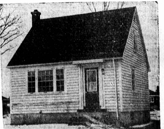
Shooting took place in this modest little home. Byrnes is said to have become sleepy and disgruntled at party, which began in beverage room, fired to "end it off."