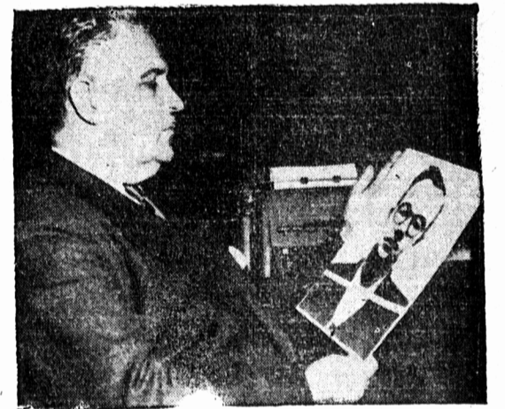
Major General Leslie R. Groves, wartime head of the Manhattan atom project, is shown in Norwalk, Conn., looking at a photo of British scientist Dr. Emil Julius Klaus Fuchs, who Groves said was one of the few who had access to U.S. plans for future atomic developments. Groves said that Fuchs, who has been arrested in London and charged with espionage, was present at Los Alamos at a time when it is understood the construction of a hydrogen bomb was first discussed. Later on in Washington, J. Edgar Hoover told a congressional committee that Fuchs has made a "complete confession" that he gave U.S. atomic secrets to Russia.