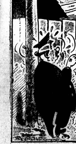
"-got them all with a Guardian Want Ad, I presume!"