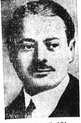
Baron L. Rothschild

Prominent Austrian banker who has been arrested in Vienna Austria, following the Nazi seizure of all branches of Government