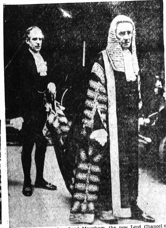
In his ornate robes, Lord Maugham, the new Lord Chancellor of Britain, accompanied by an attendant, is shown as he left the House of Lords for the Royal Courts of Justice, to be sworn-in.

March 17 saw a bustle of activity in the barrack rooms of the Irish Guards in London. To celebrate the anniversary of St. Patrick, Ireland's national saint, the regiment paraded to receive a presentation of shamrock tokens made on behalf of the Princess Royal, who is its colonel-in-chief. After the ceremony, the regiment returned to barracks, but a few minutes later most of its members were out distributing shamrocks to little London children like these who came to see the fun. Every soldier wore a shamrock.