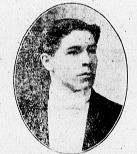
A WONDERFUL JUGGLER.