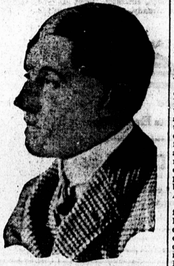
SIR F. E. SMITH.

SIR F. E. SMITH, the new Lord Chancellor of Great Britain and Ireland, is going to take the title of Lord Birkenhead. It is an excellent title, but his visit to Paris the other day raised many questionings among the anxious.