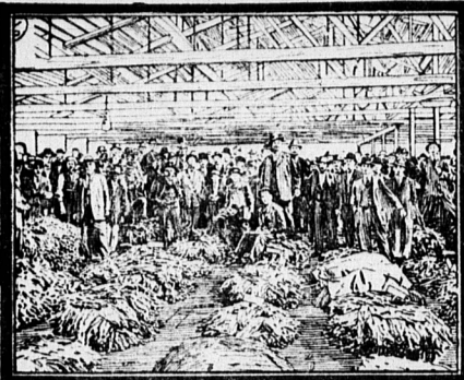
TOBACCO SERIES No. IV

Drawing made from an actual photograph of a Tobacco Auction in Virginia. The finest grade of leaf intended for export purposes is keenly contested for among bidders.