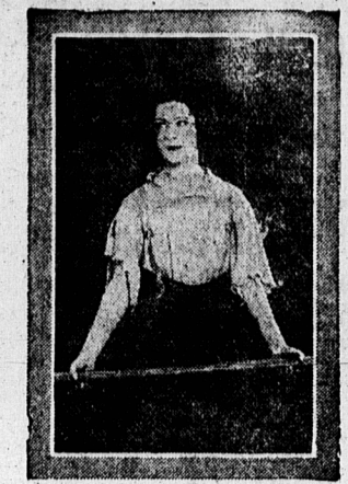
NAZIMOVA in "OUT OF THE FOG"

A story where sorrow and joy both come in from the sea, reaching triumphant heights with a supreme star. A story to wonder at. A star to idolize.