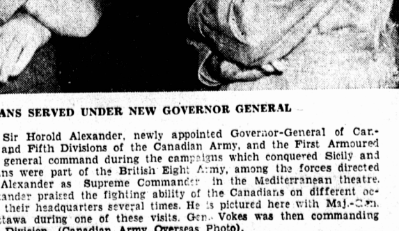
CANADIANS SERVED UNDER NEW GOVERNOR GENERAL Field Marshal Sir Horold Alexander, newly appointed Governor-General of Canada had the First and Fifth Divisions of the Canadian Army...