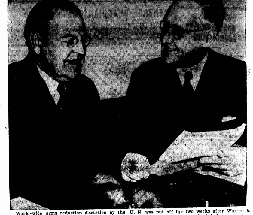
World-wide arms reduction discussion by the U. N. was put off for two weeks after Warren B. Austin, U. S. delegate, shown here on left with Australia's Norman Makin, pleaded for more time. Security council will also hear British mine charges against Albania.

SOUTHAMPTON, England — (CP) — The Union Castle Line's liner Capetown Castle has resumed the weekly mail and passenger service to South Africa. Passenger accommodation is limited for the time being.