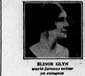
ELINOR GLYN world-famous writer on romance