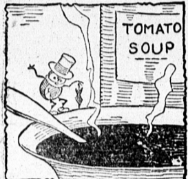
Traveler Bug: Well, well, this must be the Red Sea I've heard so much about.

To make a smashing football team Perfection all together, For quarterback engage the man Who kicks about the weather. The man who kicks about the cars Will make a fullback winner. For halfback pick a citizen Who kicks about his dinner.