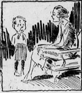
"Can't I play in the garden for a while, Mamma?" "No, you must stay in and study your nature books."