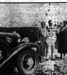
P. E. ISLANDER'S VISIT CAPE BRETON

An Ontario City Mothers' Club recently sought the privilege of distributing raffle tickets among public school scholars to sell for an object commendable in itself, but the Board of Education furnished explanations of the regulations covering this matter that made the granting of the request impossible.