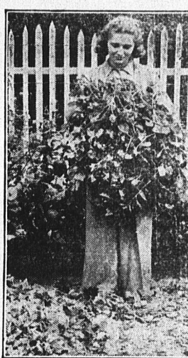
One Plant of New Zealand Spinach Will Fill a Bushel Basket

In the garden green program for the defense garden, spinach is not the most important item. It can be grown for the early summer, so be harvested before hot weather sends it up to seed, but its place on the menu will be a few weeks only, while other greens can provide vitamin-rich green leaves for months.