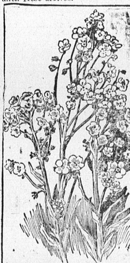
CYNOGLOSSUM AMABILE, THE NEW CHINESE FORGET-ME-NOT, IT GROWS ABOUT 15 IN. HIGH.

of the season, usually improving until frost arrives.