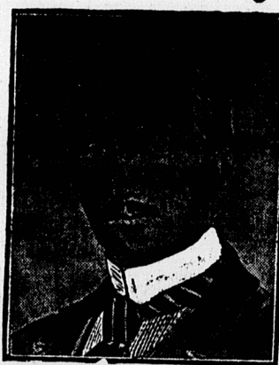
SIGNOR MARCONI Of Wireless Telegraphy Fame.