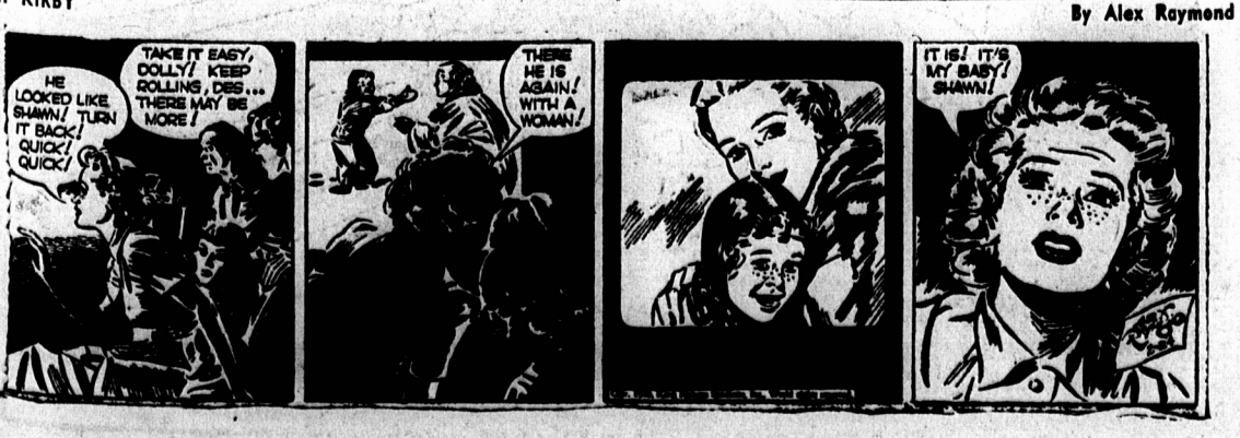
JIP KIRBY By Alex Raymond

South was ambitious enough when he responded originally with a two-over-one diamond bid. Actually, his honor-trick holding did not warrant even this response; and thus his following three-club bid over North's two hearts was little short of frightful.