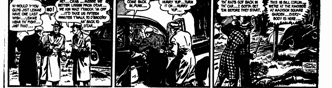
JOE PALOOKA By Hom Fisher