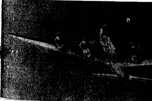
Shown in flight is the ROCAF's latest transport, the Canadian-built four-engine North Star, which went through its paces at a special demonstration held recently at Rockcliffe air station, near Ottawa.