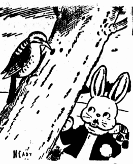
"I know you are a Woodpecker," said Peter.

What's in a name? Just what you make it. It's up to you how others take it. —Old Mother Nature. "I don't believe I know you," said Peter Rabbit rather bluntly to a stranger he had found at work only a little above his head on the trunk of a dead spruce tree in the Green Forest.