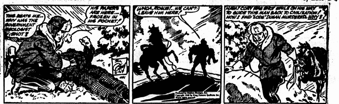
KING OF THE ROYAL MOUNTFID By Zane Grey

"You look like one, like those members of the family whom I know, only different," said Peter. The stranger chuckled. It was a good-natured chuckle. "I look like one only I don't, so I must be one. Is that it?" he asked.