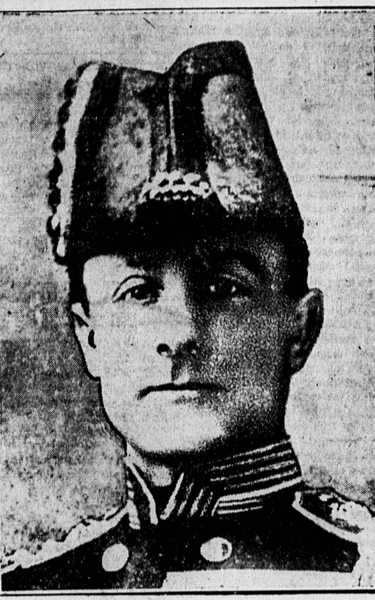
FAMOUS ADMIRAL TO SEE CANADA AGAIN

Welcomed by a 19-gun salute, and all official formalities, Earl Jellicoe, better known as Admiral Sir John Jellicoe, arrived in Quebec on Saturday aboard the Canadian Pacific liner Duchess of York. Earl Jellicoe has a busy time ahead, a feature of which is the opening of the Canadian National Exhibition.