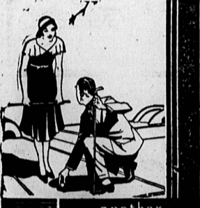
another POMPEIAN GIRL

A young man who had come down from one of the universities, was sent to a "crammer." That learned gentleman, as soon as he met his pupil, inquired: "Have you got a good knowledge of the classics?" "Well," replied the young man, hopefully, "pretty fair. I won on the Derby and Oaks last year, but I came a bit unstick on the Leger."