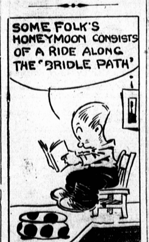
SOME FOLK'S HONEYMOON CONSISTS OF A RIDE ALONG THE 'BRIDLE PATH'