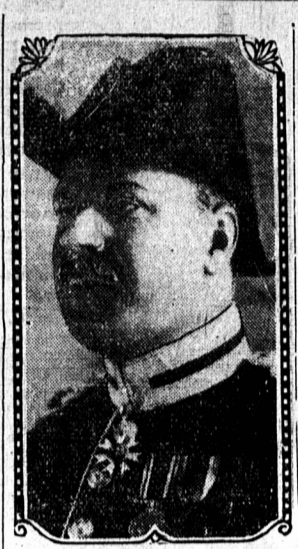
The Earl of Elgin, Lord High Commissioner of the Church of Scotland, who suffering from a throat affection, was rushed to the General Hospital immediately on his arrival at Winnipeg last week in the course of a trip across Canada with Lady Elgin. His condition is not regarded as serious.