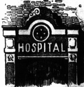
Where Most Piles Sufferers End. Act Before Too Late.

A TRIAL PACKAGE MAILED FREE. There is no reason—surely no good reason—why any man or woman should continue to suffer with piles when a reputable company of druggists have placed a every high-grade pharmacy a positive and unerring cure for this dread disease at a price within the reach of the poorest. They have done more. They offer to relieve the sufferer temporarily and slant him well on the way to recovery, by giving to any piles patient who sends his name and address, a free trial package of the wonderful Pyramid Pile Cure in a plain sealed wrapper. There are