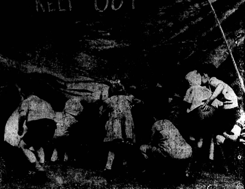
No, this familiar early-summer scene is not in South London, but in the circus carries on, war or no war. These British youngsters, just like their Canadian cousins, can't or prefer not to read the "Keep Out" signs as they scramble under the tent to see big show.