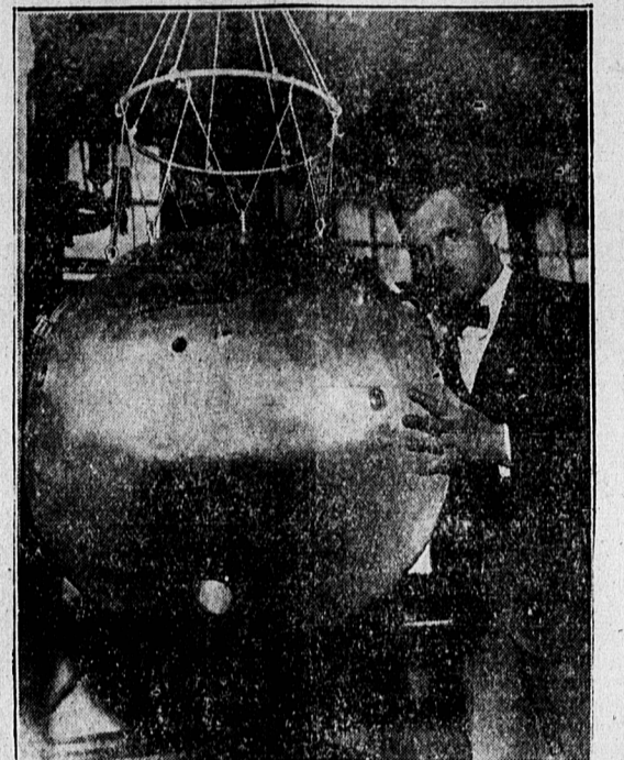
NOTED SCIENTISTS AGREE ON COSMIC RAYS Professor Arthur H. Compton, University of Chicago, is shown with a half-size aluminum model of the balloon gondola used by Prof. Auguste Piccard on his famous flight to the stratosphere last fall. Both professors are in agreement in the scientific controversy over cosmic rays.