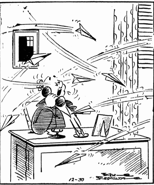
"Quick, stop My Guardian Want Ad—already there's answers all over the place!"

"With increased outside competition for new business in Newfoundland, our exporters must pay strict attention to quality of products exported and better attention to how their goods are packaged. We have quality products on Prince Edward Island, but they must be packed in attractive containers and only first grade goods shipped, otherwise Prince Edward Island will lose out in the battle now raging for markets. "We supplied a large quantity of our farm products and merchandise to American Air Bases in Newfoundland, Labrador and Greenland by boat and air during 1949, and although the American Command have made changes in their purchasing set up by establishing their central office in Halifax and they are going to fly most of their supplies from there. This does not mean that Prince Edward Island will not share in their business. Given their quality goods at competitive prices and we will get our share of their business for 1950."