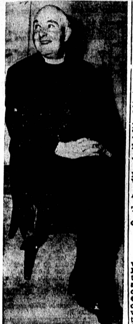
The Most Rev. Cyril Forster Garbett, archbishop of York, is pictured on his recent arrival in New York from England...