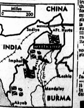
A mystery column of Allied round troops has landed astride the Mandalay-Myttha railway...