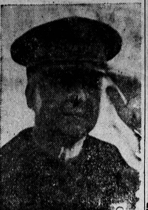
GEN. BRAMWELL BOOTH

The great chief of the Salvation Army, and son of the founder, who is coming to Canada shortly, for a tour.