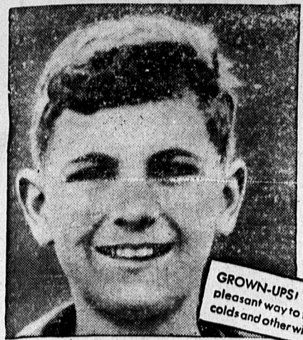
GROWN-UPS! Try this pleasant way to fight off colds and other winter ills

More proof that children take cod-liver oil willingly—this emulsified way