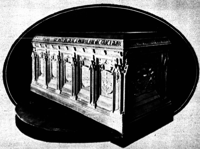
MEMORIAL CHAMBER The Walls of the Memorial Chamber are faced with Chateaux Giffard Marble, a gift from France, and its floor is paved with stones from Belgium. The Altar of Sacrifice is a block of English Marble, and will be the resting place for Canada's Book of Remembrance, in which the names of more than sixty thousand citizens who died in the Great War, are to be inscribed.

H onneur aux Canadiens qui ont combat- tu et qui sont morts pour la cause des Alliés sur les champs de France et des Flandres.