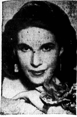
"HITLER'S ART PHONY"

DESIGN NO. 522 In seven pictures this tells a story of an old fashioned romance, worked out in simple cross-stitch. Hot iron transfer pattern No. 522 contains seven motifs measuring about 5 by 5 inches each and complete instructions. To order this design, write your name and address on a piece of paper and send with 15 cents in coin or stamps to Needlework Department, Charlotte Town Guardian, To Charlotte Town Guardian, Needlework Department, Design No. 522.