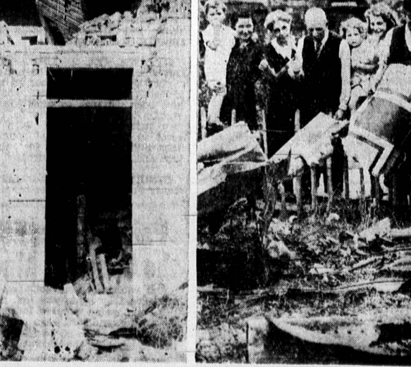
Large range of German-held Channel coast struck this and his still standing after a raid which wrecked the building, a man and his daughter were unhurt. Kenish gardens yield more than vegetables. Householders examining bits of a Nazi plane which fell in their backyard (SECOND RIGHT). Even the dog (RIGHT) appreciates the spirit of this London tavern owner whose answer to bombs was a display of flags.