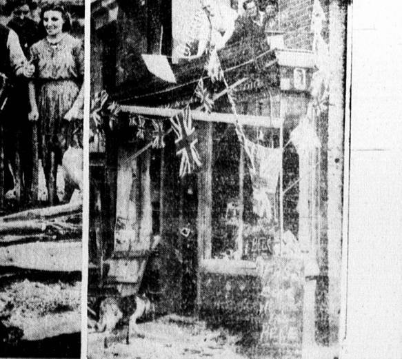
Large range of German-held Channel coast struck this and his still standing after a raid which wrecked the building, a man and his daughter were unhurt. Kenish gardens yield more than vegetables. Householders examining bits of a Nazi plane which fell in their backyard (SECOND RIGHT). Even the dog (RIGHT) appreciates the spirit of this London tavern owner whose answer to bombs was a display of flags.