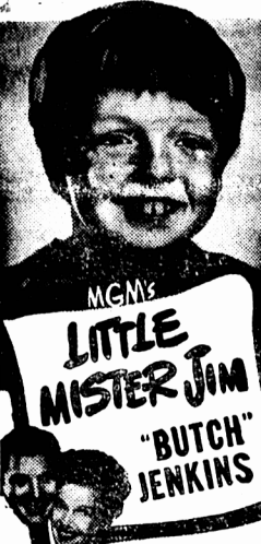
James CRAIG - Francis GIFFORD LUANA PATTEN

Butch... Butch... Butch... even better than in 'Boys' Ranch'!