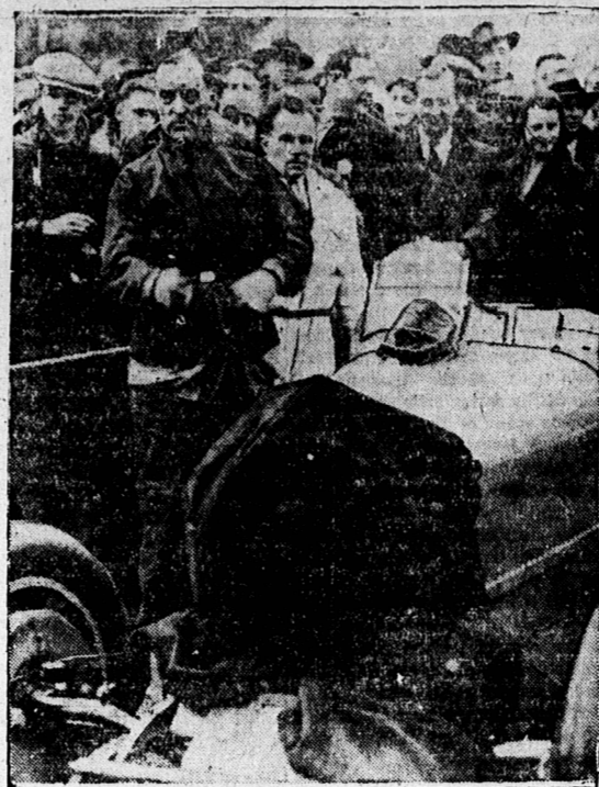
COMES NEAR DEATH

Sir Malcolm Campbell, holder of the world's automobile speed record of 100 miles per hour. Only a lucky skid saved him from almost sure death. He is shown here beside the car whose steering gear broke when travelling.