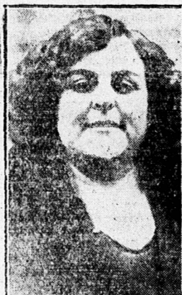
PLANS OCEAN FLIGHT