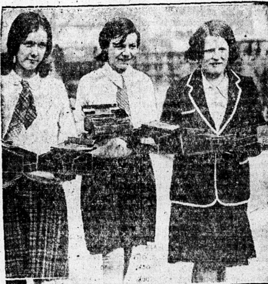
COME FROM ALL OVER BRITISH ISLES

and grandpa said: "All the kiddies better to eat you with." Happy study are enjoying the stories in the Old York, England. The maid is her grounds.