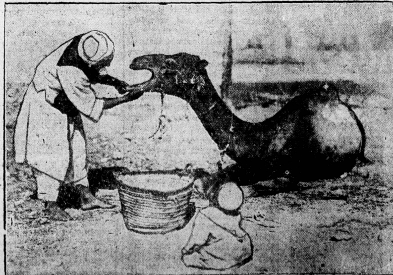
PRIDE IN ANIMAL'S APPEARANCE

Here's what the well-dressed movie star will wear at the beach this year, says Lillian Bond, here seen in rose-jersey bathing suit and cloak trimmed in black and white.