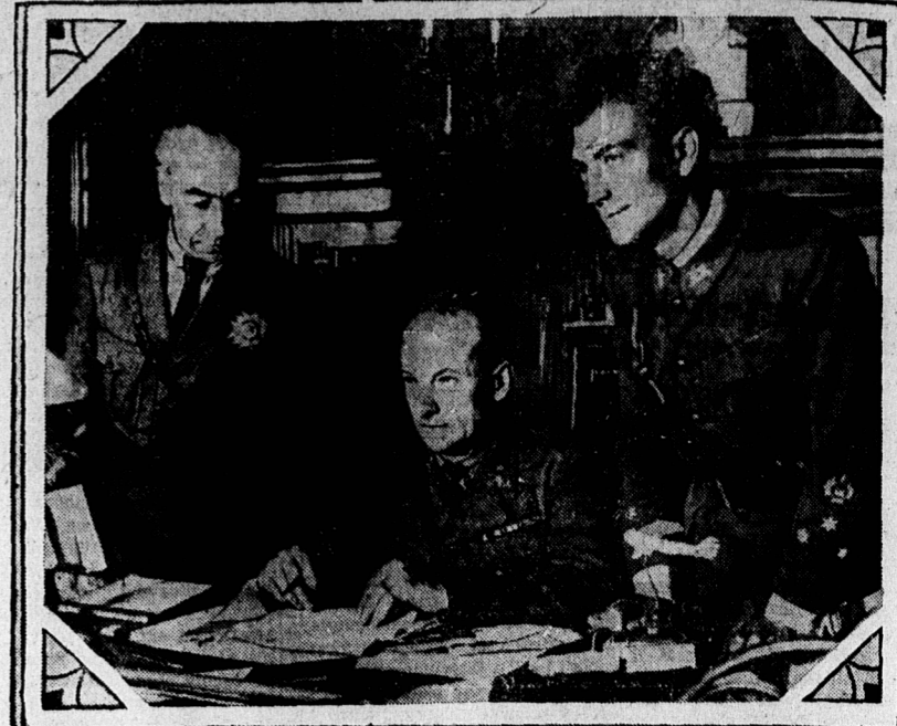
REPUBLIC OF BARCELONA COMES INTO BEING

Sir Malcolm Campbell, holder of the world's automobile speed record of 100 miles per hour. Only a lucky skid saved him from almost sure death. He is shown here beside the car whose steering gear broke when travelling.