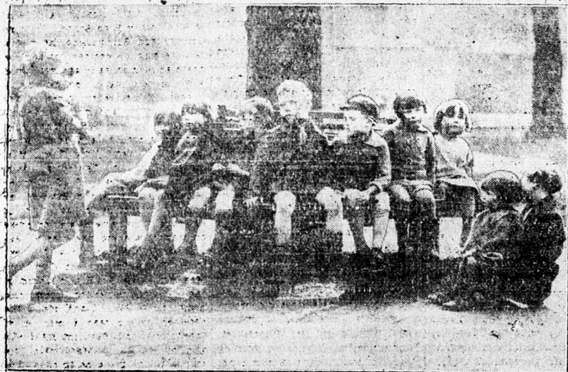
GATHER AT OLD YORK TO HEAR STORIES

Gen. Lopez Ochoa in the act of signing the proclamation which made Barcelona a Republic after the re- officers who served with him in the of the former king.