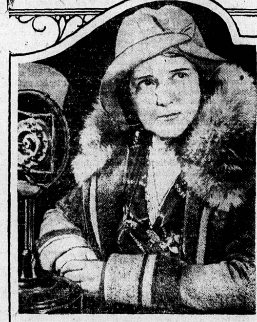
LINDERBERG'S MOTHER TAKES TO AIR

Randolph Spencer Churchill, son of Winston Churchill, who has been touring United States and Canada, photographed while visiting a college at Toronto, Ontario.