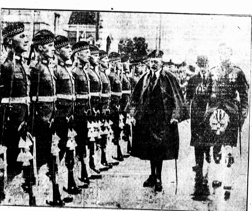
King George reviewing his guard of honor formed by the first home battalion Argyll and Sutherland Highlanders upon his arrival in Balfour, Scotland, for a holiday.